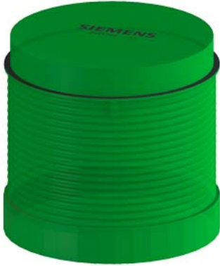
Flashlight element, with integrated LED, green, 24 V AC/DC, Diameter 70 mm