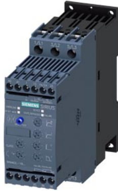
SIRIUS soft starter S0 32 A, 18.5 k kW/500 V, 40 °C 400-600 V AC, 110-230 V AC/DC Screw terminals