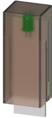
LED module, green, 24 V DC