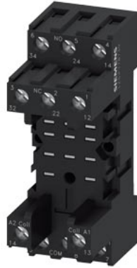
plug-in socket for PT relay, 3 changeover contacts, screw terminal