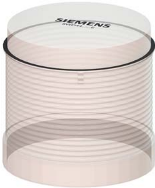
Single-flash light element, w. built-in electronic flash, clear, 115 V AC, Diameter 70 mm