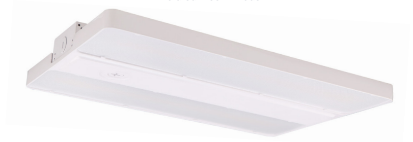
Pictured: 220W model