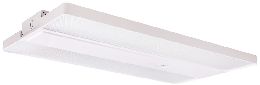
Pictured: 295W model

for easy installation of optional Motion Sensor (sold separately)