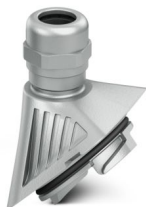
EVO EMC cable gland with bayonet locking, B series, size M25, cable diameter: 11 ... 16 mm

Please be informed that the data shown in this PDF document is generated from our online catalog. Please find the complete data in the user documentation. Our general terms of use for downloads are valid.