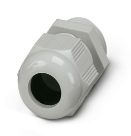
Cable gland, material for screw connection: PA, application: Standard, external cable diameter 6 mm ... 12 mm, shielding: no, connecting thread: Pg13.5, color: lightgray RAL 7035

Please be informed that the data shown in this PDF document is generated from our online catalog. Please find the complete data in the user documentation. Our general terms of use for downloads are valid.