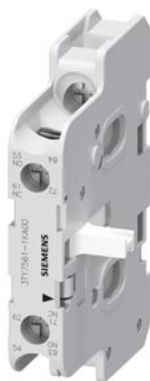
Auxiliary switch block, for size 3...12 2nd auxiliary switch block left or right