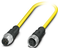
Sensor/actuator cable, 4-position, PVC, yellow, Plug straight M12, coding: A, on Socket straight M12, coding: A, cable length: 15 m

Please be informed that the data shown in this PDF document is generated from our online catalog. Please find the complete data in the user documentation. Our general terms of use for downloads are valid.