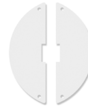
Junction Box Cover