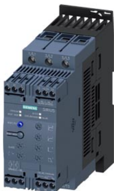
SIRIUS soft starter S2 72 A, 37 kW/400 V, 40 °C 200-480 V AC, 24 V AC/DC Screw terminals