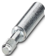
Coding peg for coding up to 16 connectors

Please be informed that the data shown in this PDF document is generated from our online catalog. Please find the complete data in the user documentation. Our general terms of use for downloads are valid.