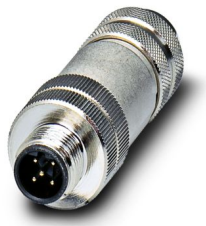
Data connector, PROFIBUS, INTERBUS, 5-position, shielded, Plug straight M12, coding: B, Screw connection, knurl material: Zinc die-cast, nickel-plated, cable gland Pg9, external cable diameter 6.5 mm ... 8.5 mm

Please be informed that the data shown in this PDF document is generated from our online catalog. Please find the complete data in the user documentation. Our general terms of use for downloads are valid.