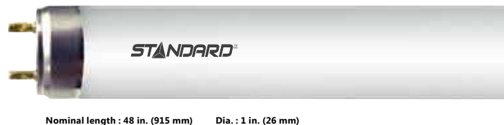
Nominal length : 48 in. (915 mm) Dia. : 1 in. (26 mm)

Order code: 10917 Description: F32T8/850K/XL31 UPC: 69549109179 Case quantity: 25