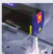
Laser Marking Systems