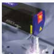
Laser Marking Systems