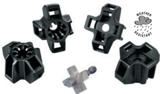
The Stud Mount Cable Fastening System includes a range of bases and the custom drill bit that mounts all sizes.