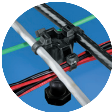
Virtually unlimited harnessing flexibility is provided in the unique 10-position harness design of the Stud Mount base.