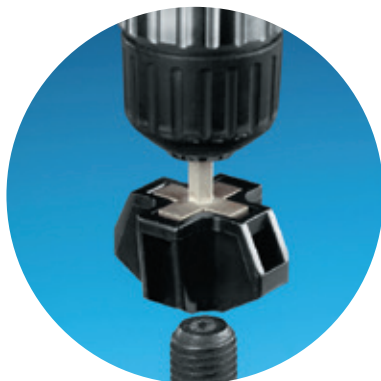
During installation, the custom Stud Mount drill bit application tool ejects itself from mounting base, ensuring proper torque and preventing cracking or breaking of the mount from being overtightened.