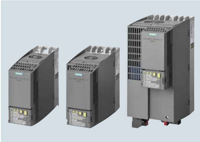
SINAMICS G120C frame sizes FSA, FSB and FSC with mounted blanking cover

SINAMICS G120C compact inverters offer a well-balanced combination of features to address a wide range of applications. They are compact, rugged devices that are easy to operate and can be optionally equipped with a basic or advanced operator panel.