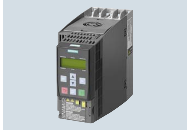
SINAMICS G120C, frame size FSB, with BOP-2

The compact mechanical design and the high power density allow these devices to be installed in machine control enclosures and control cabinets for maximum space utilization. The SINAMICS G120C compact inverter can be butt-mounted directly, without derating; the PROFINET version can be butt-mounted up to 55 °C (131 °F).