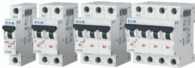
Optimum and Efficient Protection for Every Application