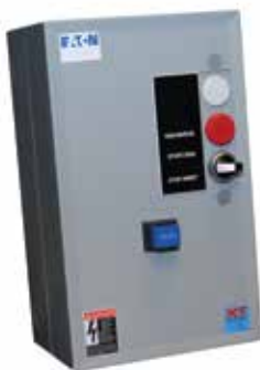
NEMA Type 1