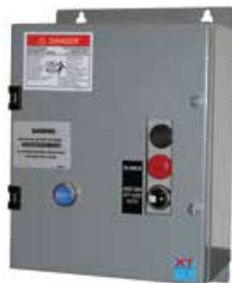
NEMA Type 12/3R