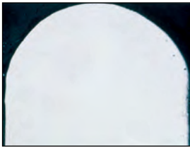
Panduit tie body