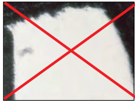
Other manufacturer's tie body

The Pan-Steel® Stainless Steel Cable Tie features fully rounded edges to assure bundle protection and operator safety. Panduit not only removes the burr, but actually passes the material through a secondary process which removes the top and bottom corners of the material.