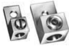
Fig. 1 Fig. 2