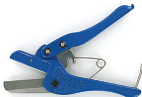
WT-1 Cutting Tool