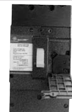
Right Side Pouch