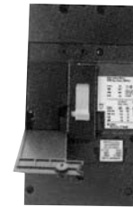
Left Side Pouch

All accessory contacts shown with the circuit breaker in tripped position.